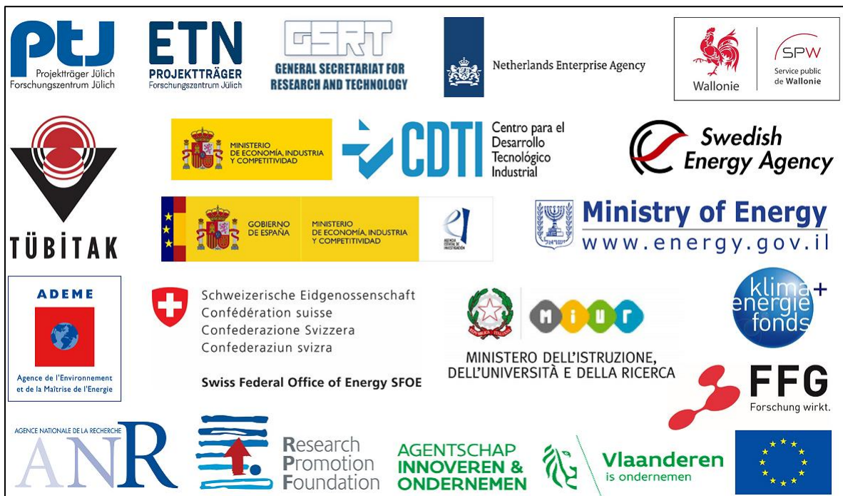
Figure 1: Organisations involved in promoting the SOLAR-ERA.NET Cofund 2 Joint Call and providing support and funding to innovative transnational projects.

The participating national SOLAR-ERA.NET partners / contact points are listed in Table 1. Each applicant have to check the project idea with the national contact point as early as possible in the preproposal phase, at the latest before submitting any applications.