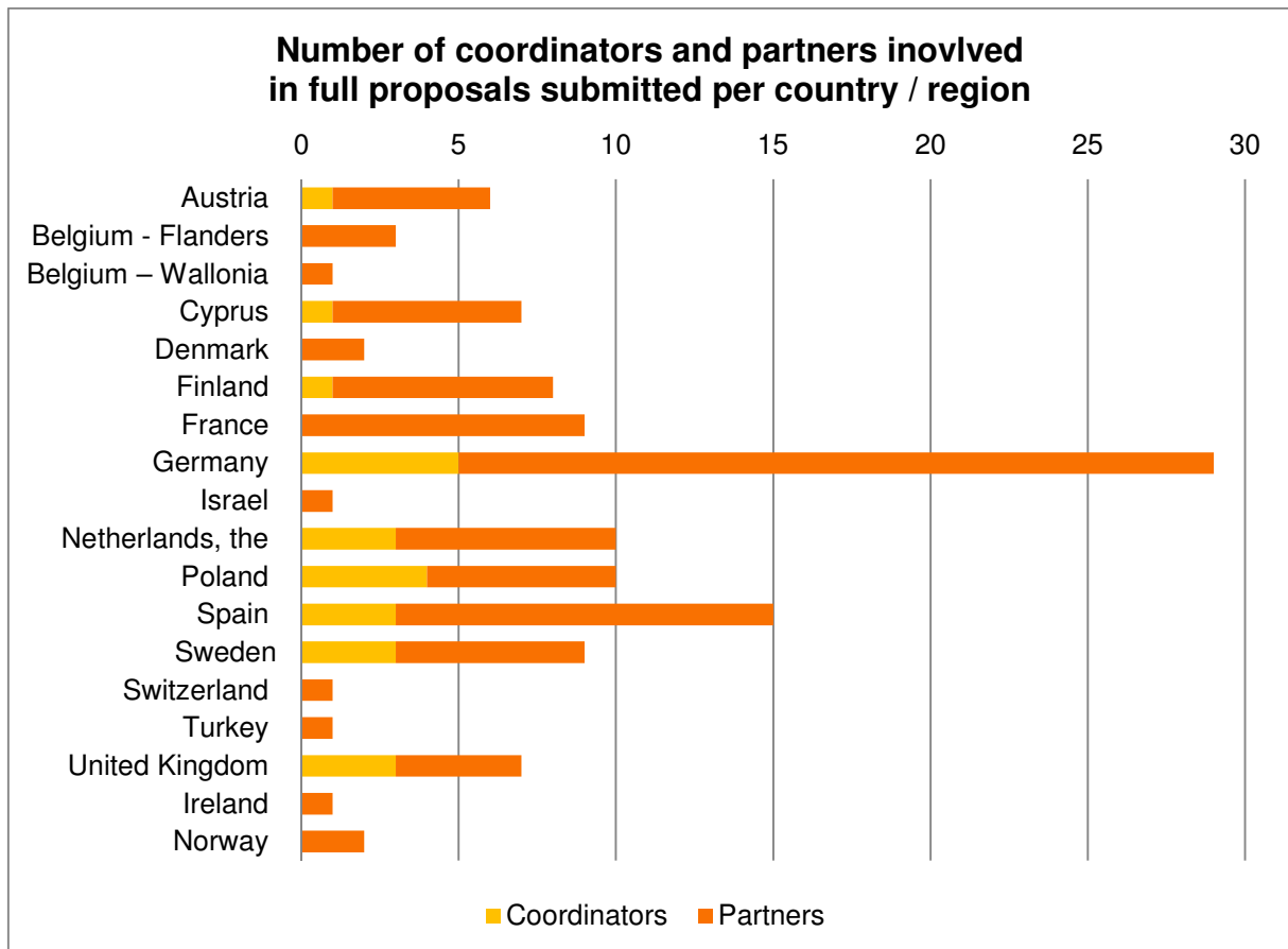
Figure 1: Number of coordinators and partners in the full proposals submitted by country / region participating in the SOLAR-ERA.NET call