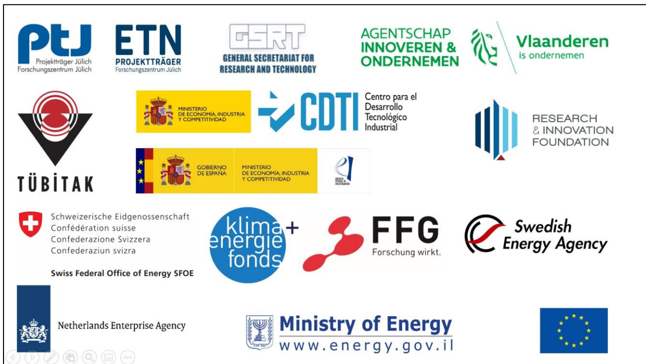
Figure 1: Organisations involved in promoting the SOLAR-ERA.NET Cofund 2 Additional Joint Call and providing support and funding to innovative transnational projects.

The participating national SOLAR-ERA.NET partners / contact points are listed in Table 1. Applicants are strongly encouraged to check the project idea and specific requirements with the national / regional contact point as early as possible in the preproposal phase.